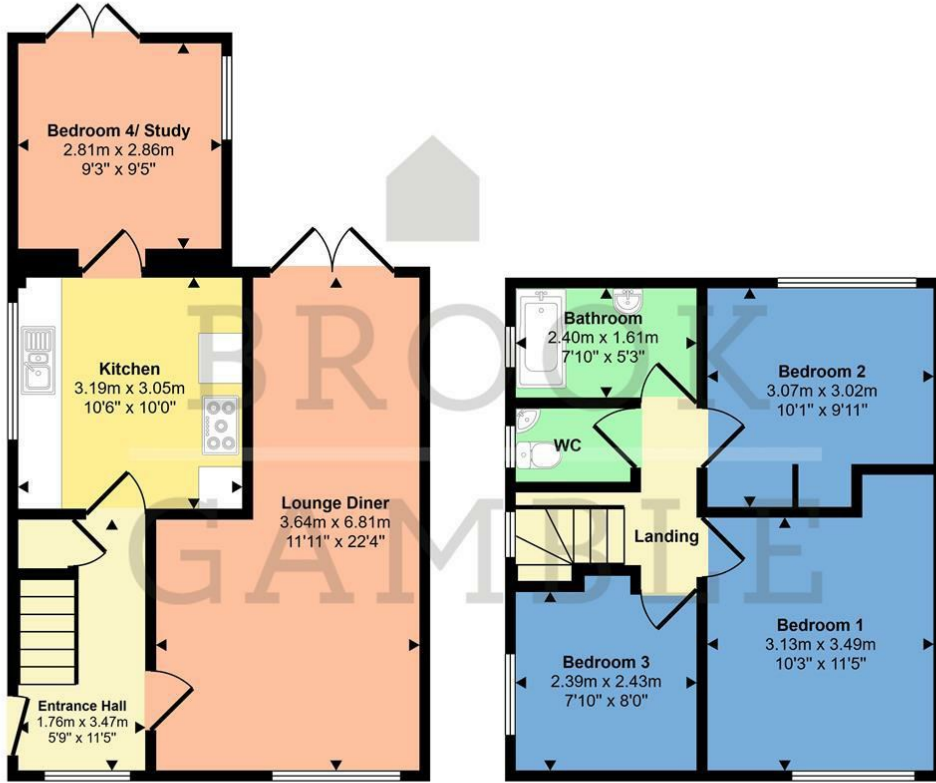
Ground Floor Approx 47 sq m / 502 sq ft

Approx Gross Internal Area 85 sq m / 916 sq ft